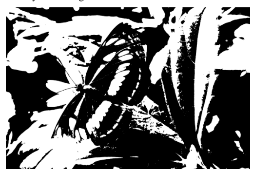
3. Binary image