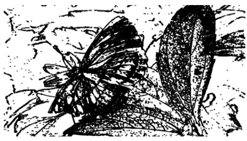
5. Output Vector image with Threshold 20

4. Target portion Zoomed of Binary image