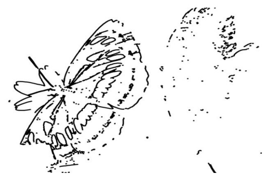
7. Output Vector image with Threshold 100