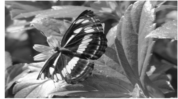
2. Gray scale image

1. Original image captured with Canon PowerShot SX610 HS (target portion is shown with red circle)